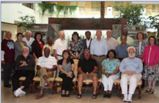
Housing Assistance Council Board of Directors